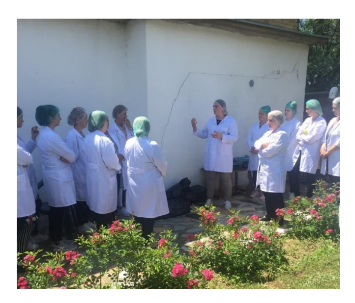
Training session of Initiative for Agricultural Development in Kosovo for rural women in the village of Podujeve, teaching women how to make strawberry jam. June 2019.

Non-governmental organizations (NGOs) have been instrumental in the post-war reconstruction of Kosovo. Agents of NGOs have been particularly active in the sphere of women's rights in the twenty-year period following the war. The activity of NGOs has led to the creation of networks between local and international organizations and has fortified connections between urban and rural women involved in activist work. This research project seeks to analyze the causes that led to a rise in women's organizations after the war in Kosovo and the impact of the work of feminist-based organizations in Kosovar society through in-depth participant observations, interviews, and examination of collections of local NGO records.