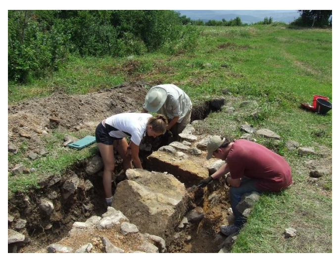
PFP2009, students excavating wall of a Roman public building

Serbia along the way. I explored major cities, such as Ljubljana, Belgrade, and Budapest, as well as historical sites like Carnuntum and Sirmium.