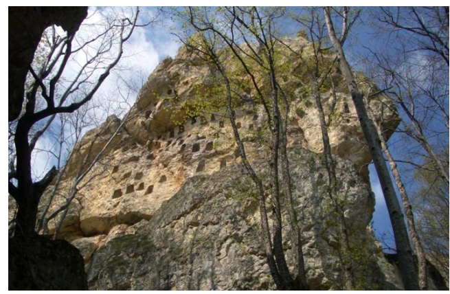
Gluhite Kamani: rock outcrop with niches

After the Congress, I took part in an excursion to eastern Bulgaria and visited several archaeological sites, all new to me. The one that made the strongest impression on me was the site of Gluhite Kamani ("Deaf Stones" in Bulgarian), near the town of Lyubimets, not far from the Turkish border. Located in a beautiful region of the Rhodope Mountains, Gluhite Kamani is the center of an intriguing series of carvings, primarily trapezoidal niches, found in the natural mountain rock. It was believed to be an ancient Thracian cult center, but at that time, no one knew much about it. The combination of beautiful natural scenery and an intriguing archaeological problem made a powerful impression. I remember thinking, "Someday I will come back and explore this further."